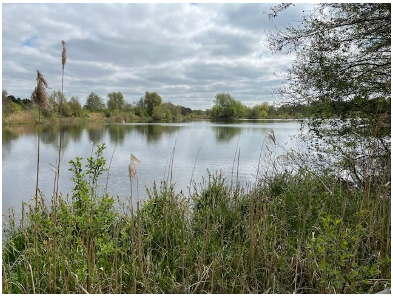
Lackford Lakes ~ Suffolk Wildlife Trust

Please forward this to anyone you know who might not be in our Google group. For information about us please visit: <a href="www.northburychurches.org.uk">www.northburychurches.org.uk</a>