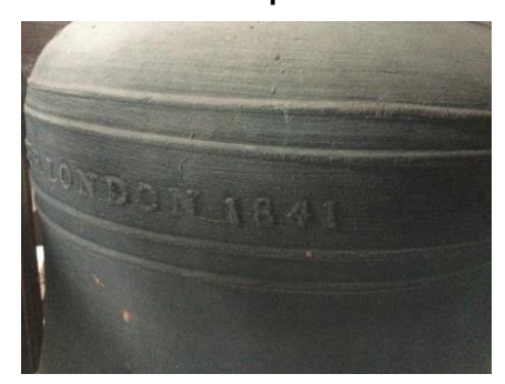
Detail on the bell