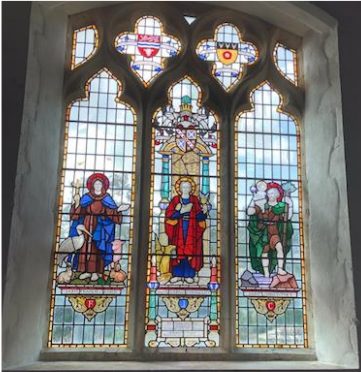
At St Catherine, Flempton

For information about us please visit: www.northburychurches.org.uk