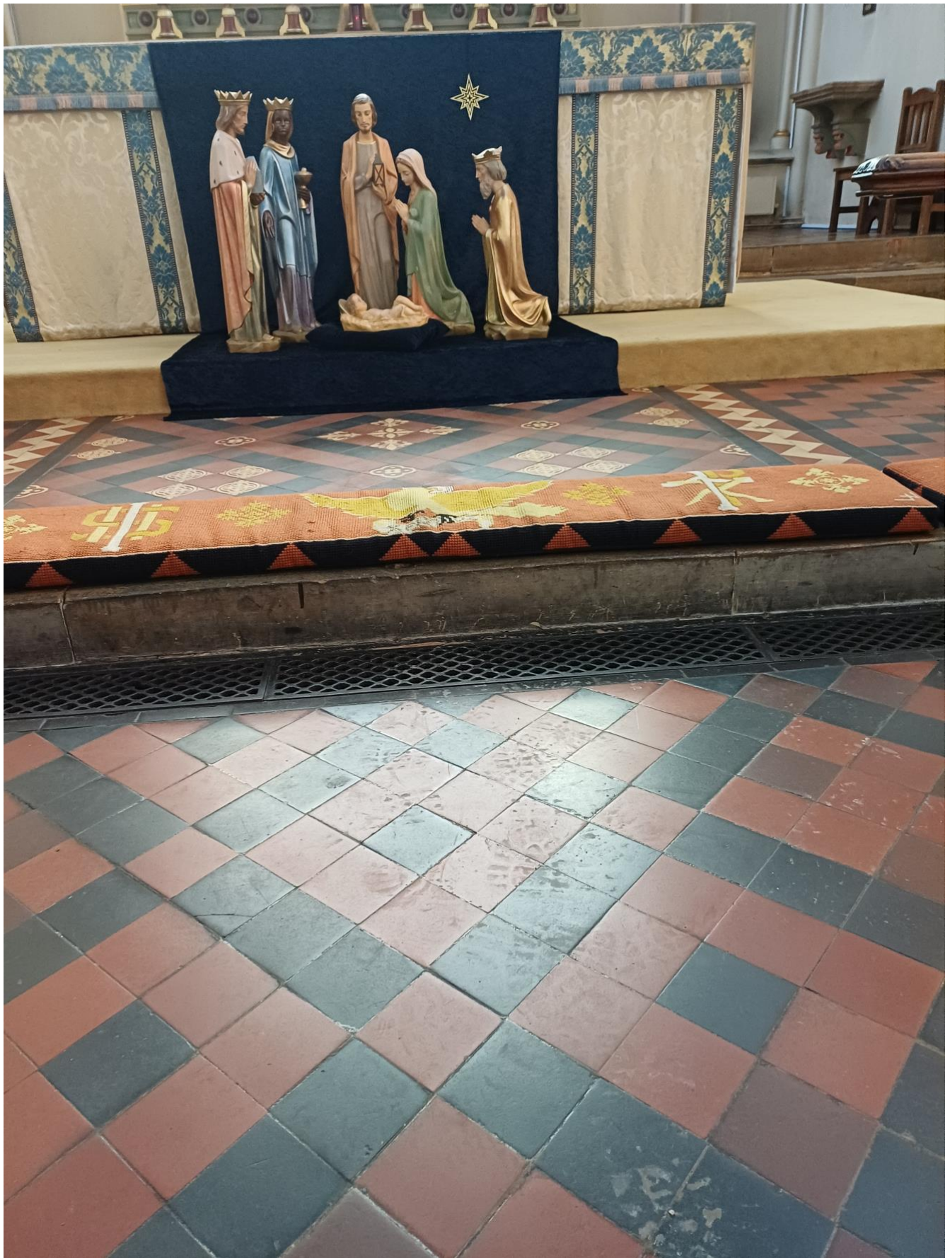
Footsteps to the manger