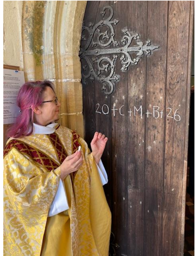
Photos taken on the feast of Epiphany at St Andrew's, Timworth and at St John's, Bury St Edmunds.