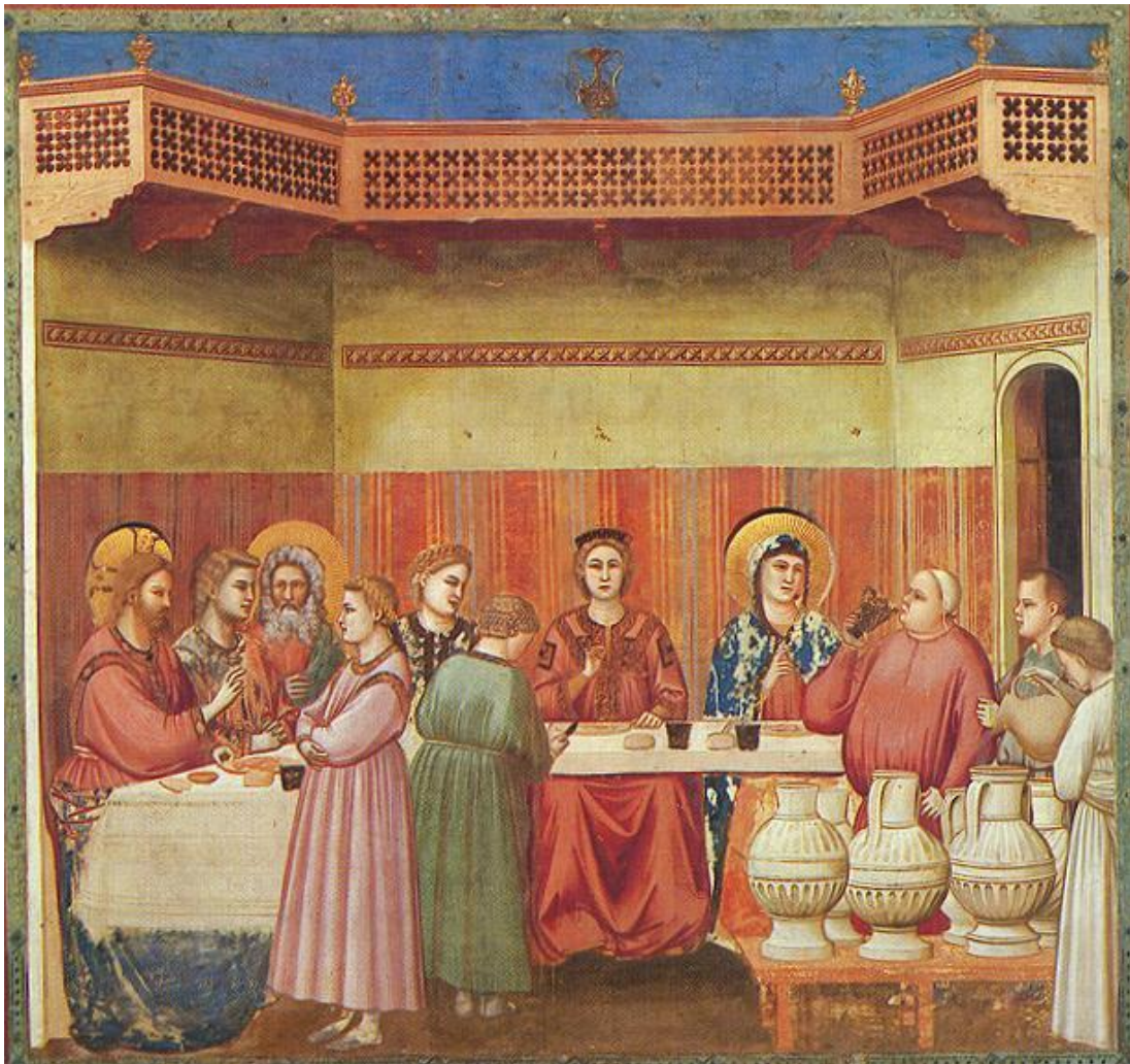
Marriage at Cana, Scrovegni Chapel, Padua

Please forward this to anyone you know who might not be in our Google group. For information about us please visit: www.northburychurches.org.uk