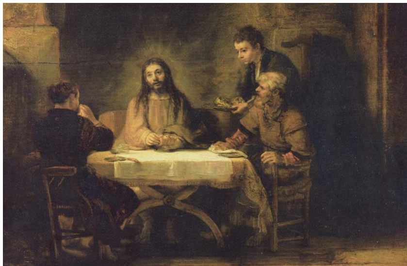
Supper at Emmaus (detail)

Then it’s dinner time in the inn. And this stranger that they met on the road when they were going away from Jerusalem to Emmaus takes bread, blesses it, breaks it and gives it to them.