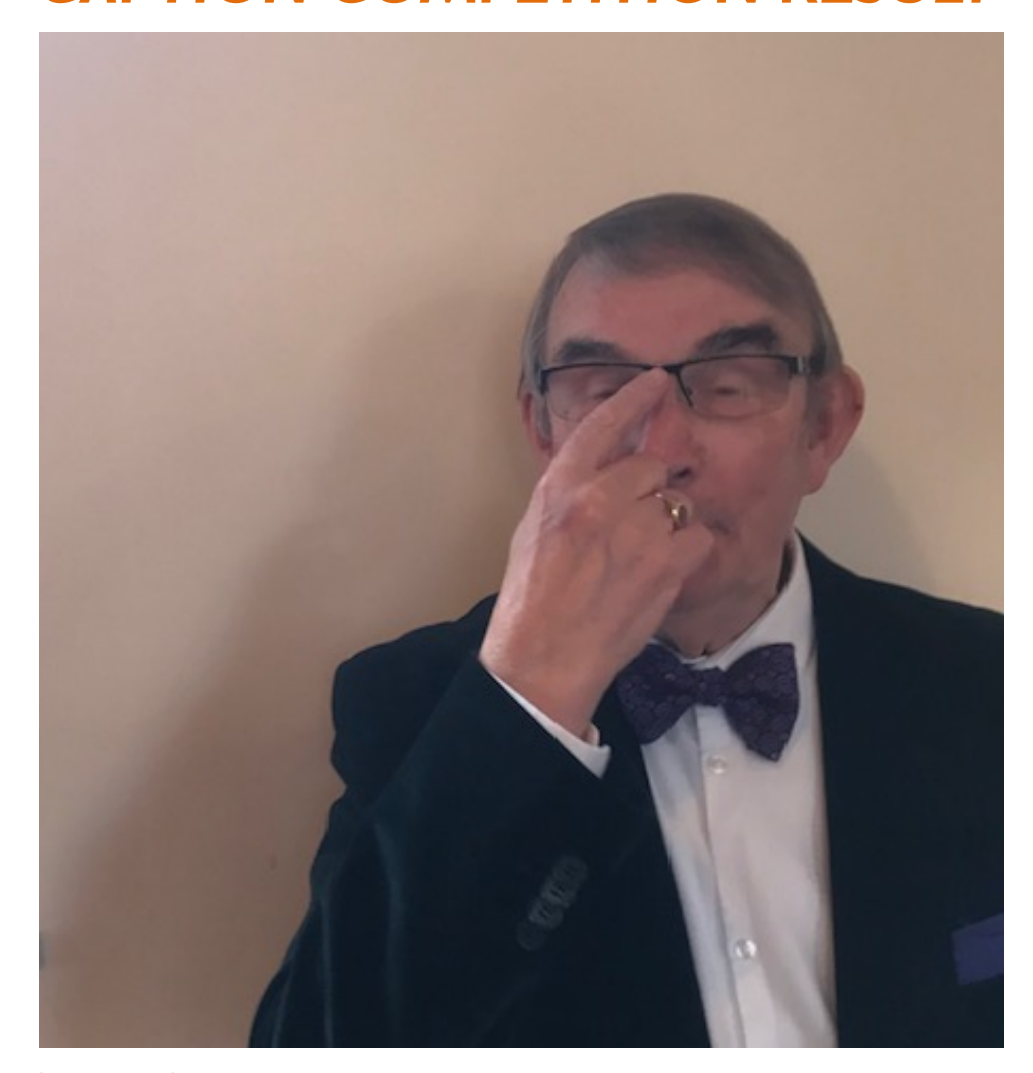
Some of the entries have been immaculately turned out. Here they are:

'I told you I could push the baton up my nose.'