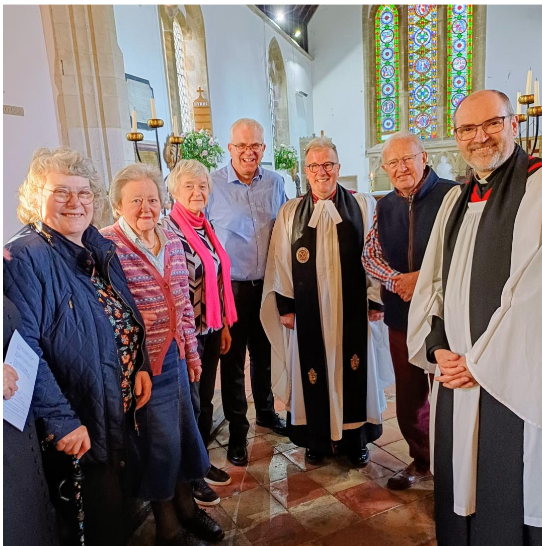
Lark Valley and North Bury churchwardens seen with the Rural Dean (aka the Team Rector) at the Archdeacon's Visitation in Barrow church on Tuesday evening, 9 June.

Please forward this to anyone you know who might not be in our Google group. For information about us please visit: www.northburychurches.org.uk