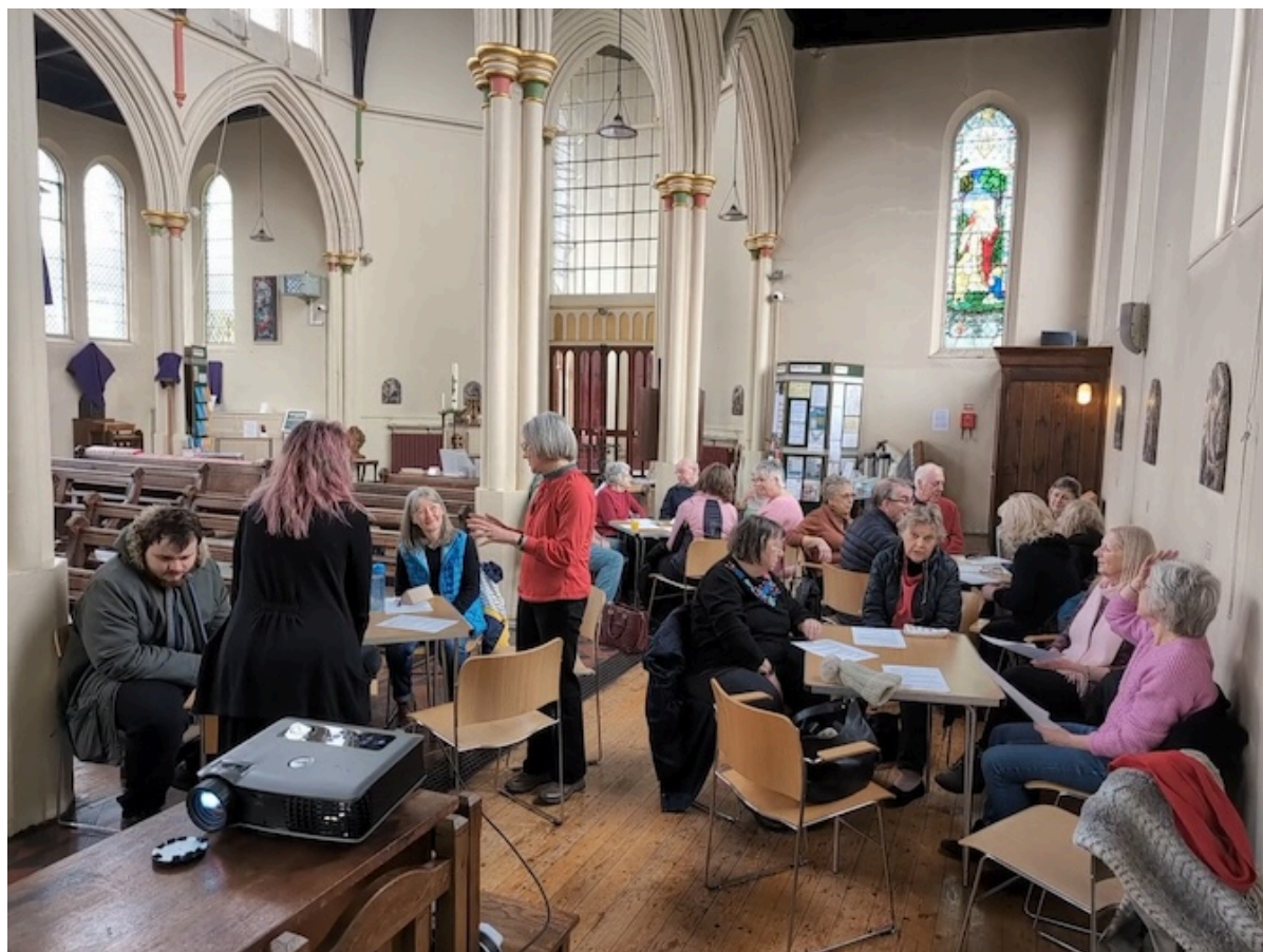
The final meeting of the Lent Course 'Bread of Life'