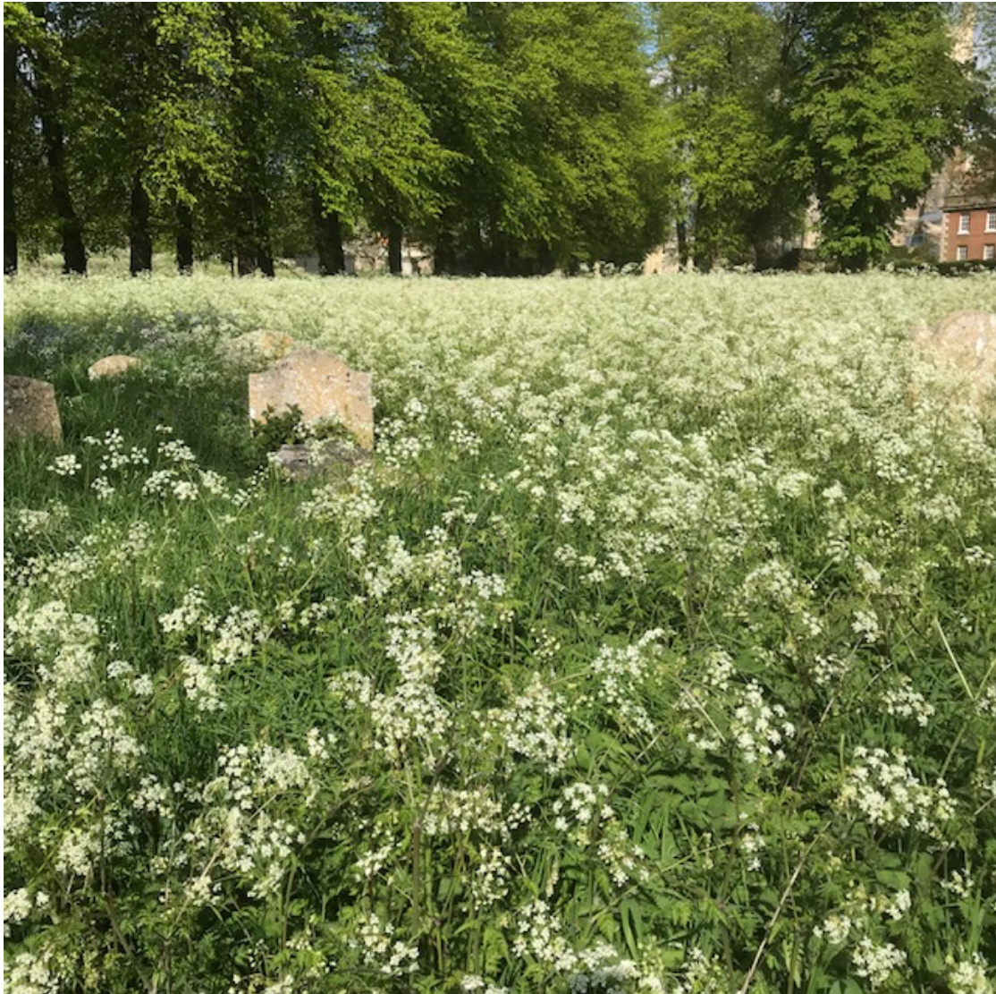
Great Churchyard, Bury St Edmunds

For information about us please visit: www.northburychurches.org.uk