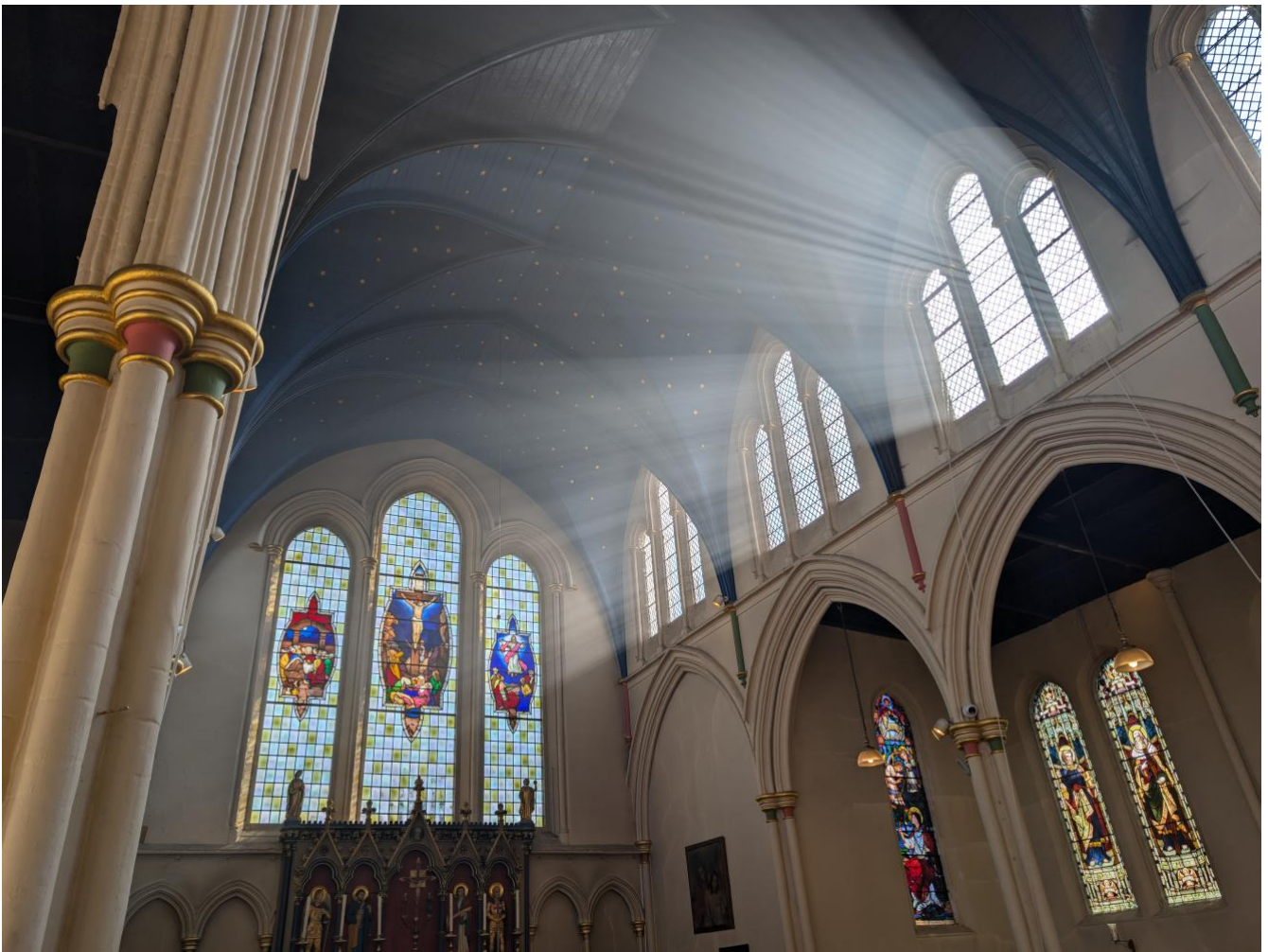
St John's church in the sun

Please forward this to anyone you know who might not be in our Google group. For information about us please visit: www.northburychurches.org.uk