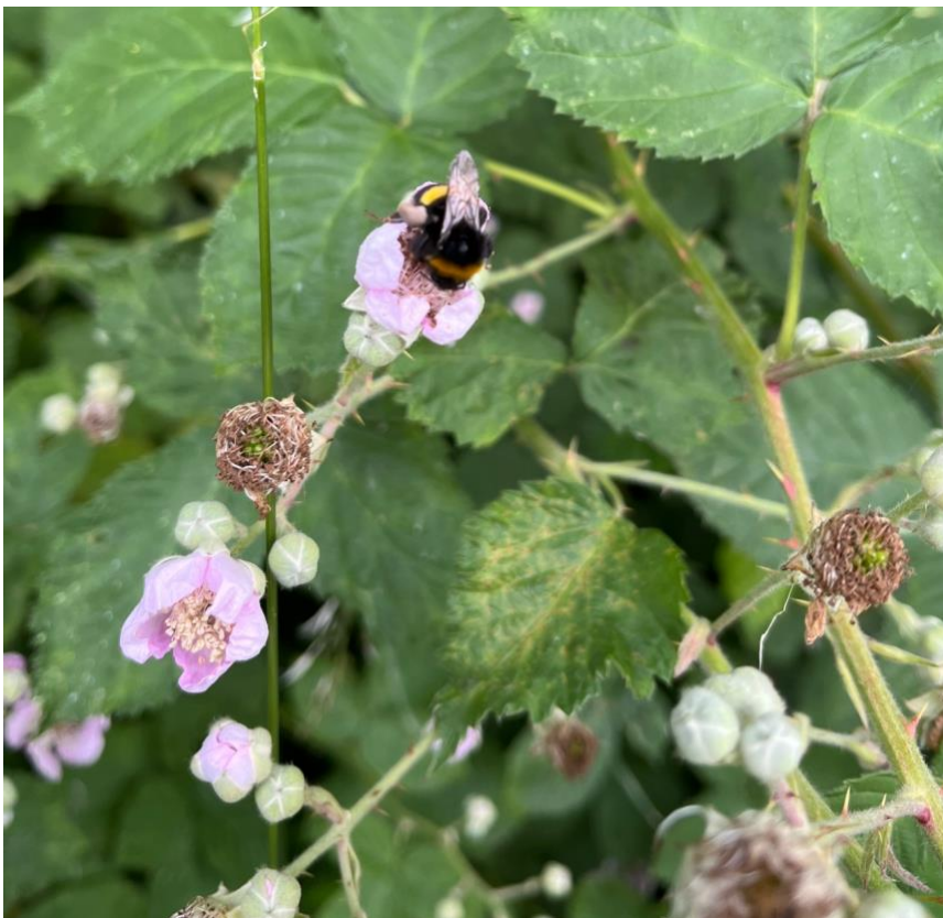
Bumblebee in action near the River Lark in Bury St Edmunds.