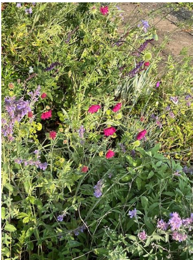
Garden at All Saints', Bury St Edmunds

For information about us please visit: www.northburychurches.org.uk