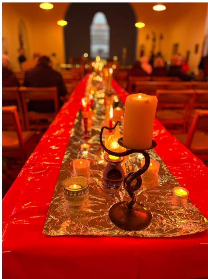
Carols and Readings at St George's, 10 th December