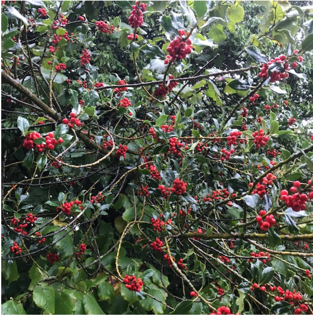
Holly by the River Linnet

For information about us please visit: www.northburychurches.org.uk