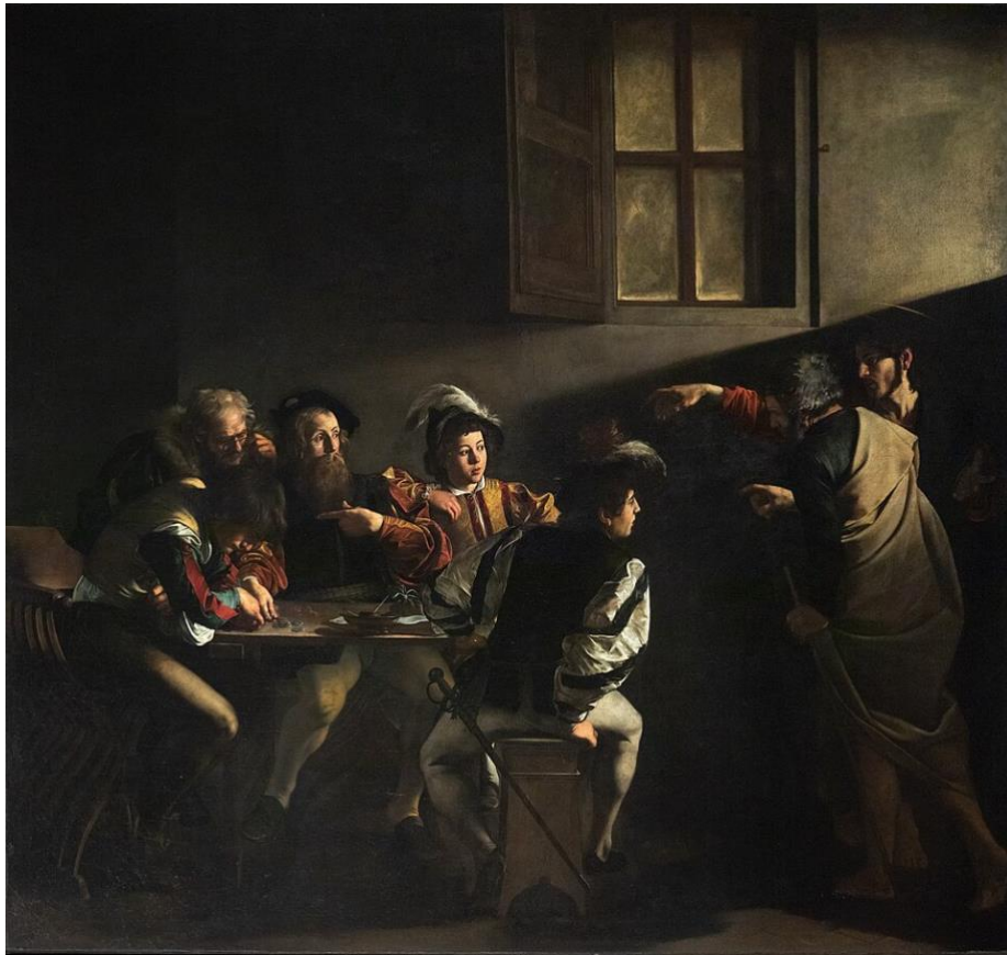
The Calling of St Matthew