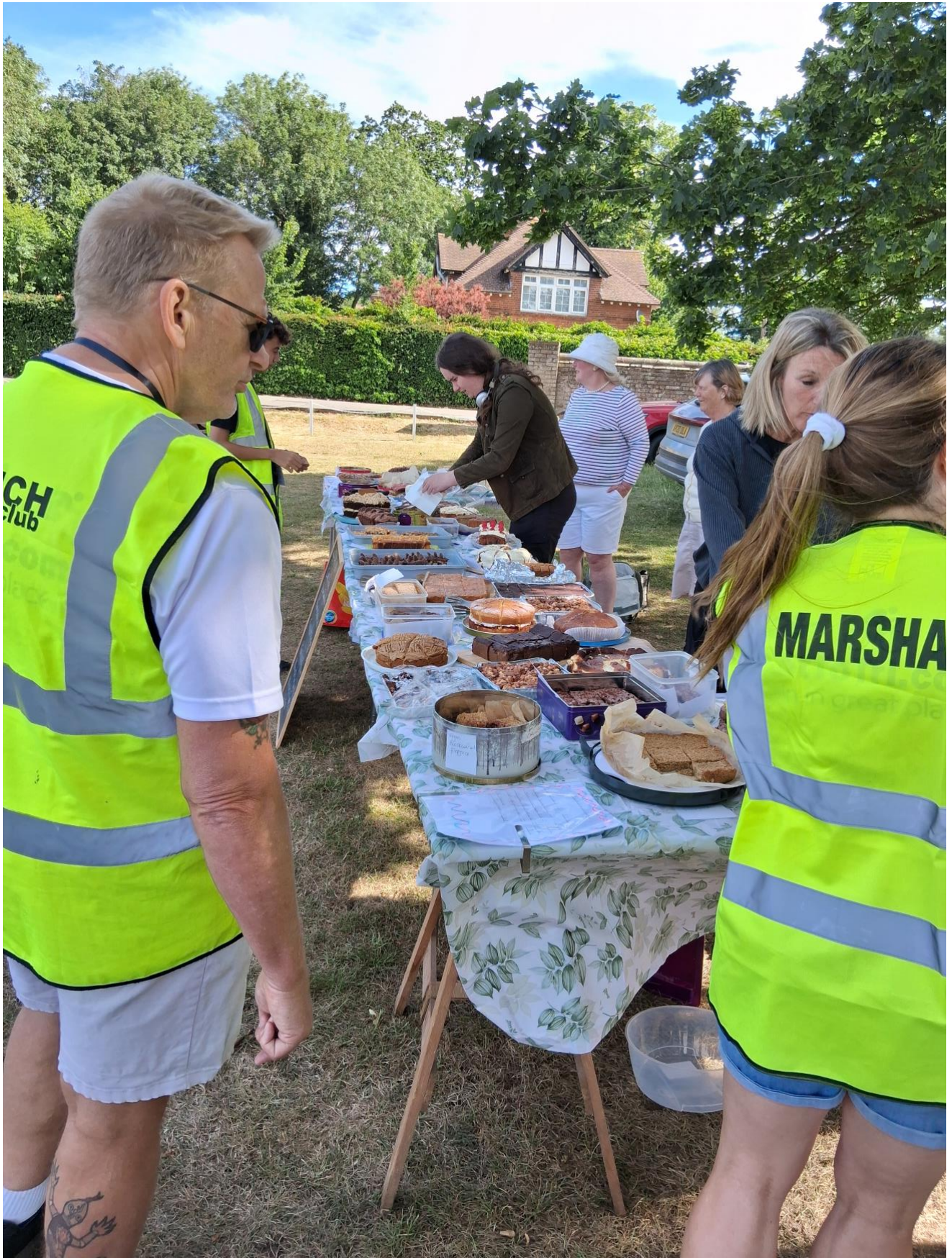
St Mary's, Culford cake stall at the triathlon held at Culford School on Sunday 31 st May ~ a very successful event.