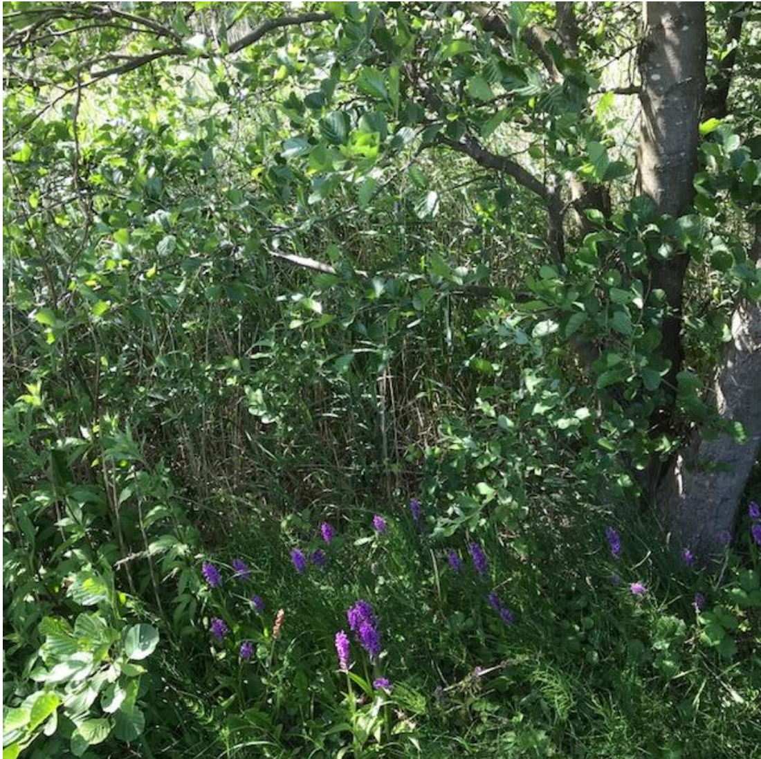
At RSPB Minsmere in June

For information about us please visit: www.northburychurches.org.uk