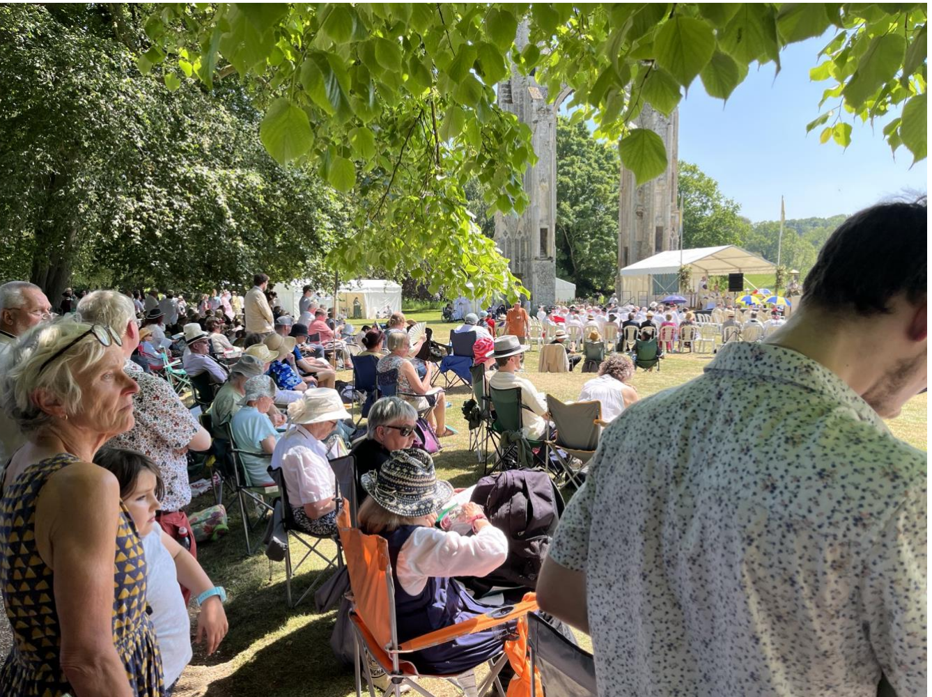
Lark Valley and North Bury pilgrims seek the shade along with others in the Abbey grounds at Whit Monday's National Pilgrimage to the Shrine of Our Lady of Walsingham in Norfolk.